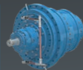
Brevini™ Winch Drives SLW Series