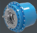
Brevini™ Winch Drives PWD Series