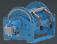
Brevini Evolution™ Series Winches